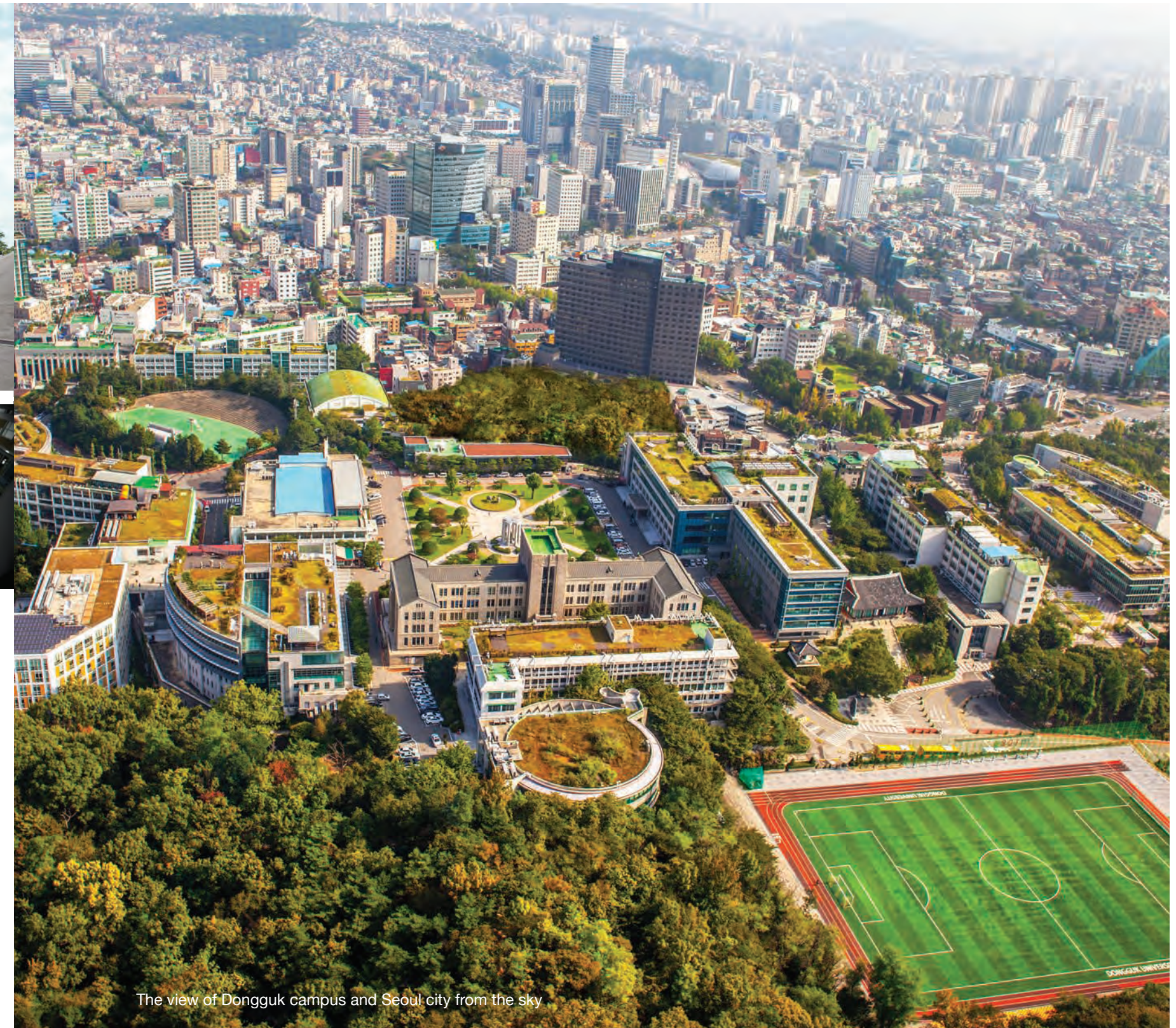
The view of Dongguk campus and Seoul city from the sky